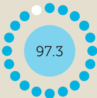
Average ATAR of the top 50% of our IB Diploma students